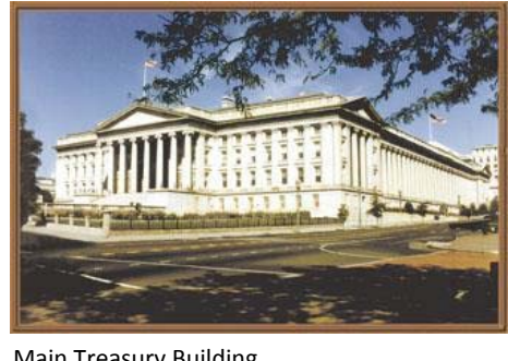
Main Treasury Building

Project results, which represent an estimated $3.5 million in energy and lease cost savings annually, include: a 43% decrease in the use of potable water; a 7% decrease in electrical usage; a 53% decrease in the use of steam; and 164 additional workstations within the building. Watch Assistant Secretary Dan Tangherlini discuss how Treasury achieved this unique distinction.