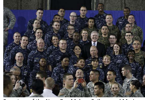
Secretary of the Navy Ray Mabus, Sailors, and Marines await President Obama's remarks on energy initiatives at Buckley Air Force Base.

In his recent State of the Union speech, the President announced that the Department of the Navy will make the largest renewable energy purchase in history – one gigawatt. The Department of Navy has committed to adding 1 gigawatt of renewable energy produced from sources such as solar, wind, and geothermal to its energy portfolio for shore-side installations – enough to power 250,000 homes. Using existing authorities such as power purchase agreements, the Navy will ensure these energy projects are cost neutral and require no up-front investments by the government.