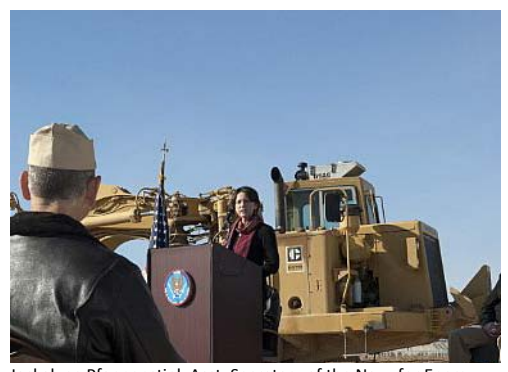
Jackalyne Pfannenstiel, Asst. Secretary of the Navy for Energy. Installations and Environment, speaks at the groundbreaking ceremony for the Navy's newest solar farm at Naval Weapons

On December 5th, 2011 Navy also signed a contract to purchase 450,000 gallons of bio-fuel, the single largest purchase of biofuel in government history. The purchase helps to decrease the military's dependence on foreign oil.