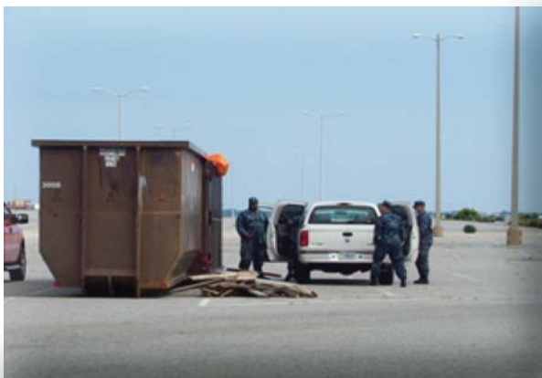
Of the 334 volunteers that participated at Naval Station Norfolk, 55% were from the military.

Among the most common items collected were cigarette butts, plastics bottles bags, and wood debris. Some of the most unusual items collected were a person-sized ball of fishing twine, a rat-trap, 1/2 of an Engine block and a $50 dollar bill. It really does "pay" to Clean the Bay.