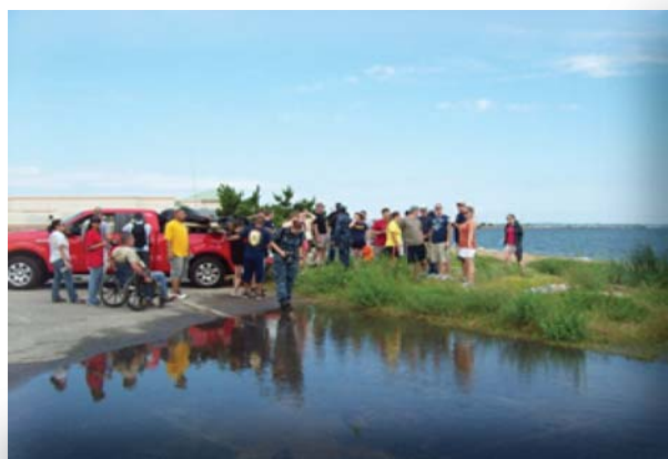
62 Volunteers participated in the 2012 Clean the Bay Day from the USS Kearsarge.