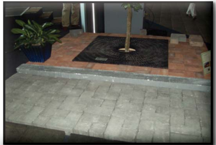
Above is the standard look of the Biopave™ Stormwater Management System (PICP plus Filterra system) that would be ideal for streetscapes, parking lots, urban and industrial settings.

The cost and maintenance of the Biopave™ Stormwater Management System does vary. The life cycle cost of the system can be as high as 50 years. Additionally, maintenance is required to prevent clogging of the pavers via street sweeping. Filterra® offers the first year of maintenance for free with any unit purchased and annual contracts that range from $325 to $800.