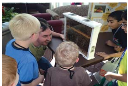
Virginia Army National Guard Environmental Personnel teach children about the importance of bees.