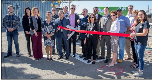
LLNL – Celebration of new charging stations in 2019

of GHGs per year from its EV Fleet and PEV programs and achieved over $1,500 in fuel cost savings for its government owned fleet vehicles. LLNL's personal and fleet EV programs have led to a reduction of an estimated 345 metric tons of carbon dioxide equivalent of greenhouse gases (GHG) per year, which will only increase as the program expands.