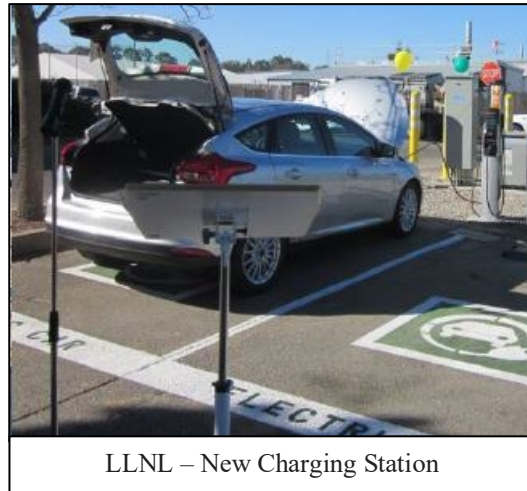
LLNL – New Charging Station