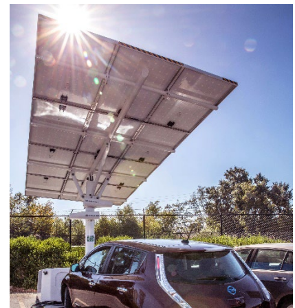
LLNL – Envision Solar Portable Solar charging stations

use, avoided GHG emissions, station utilization, session duration, and more. The Envision Solar portable charging stations provide real time data as well as a monthly breakdown of energy produced and energy output for vehicle charging. In addition, the government-owned Ford Focus EVs allow the fleet division to have real time access to vehicle information to help manage charging, locate vehicles, track kilowatt hours used, EV miles, fuel economy, pounds of carbon dioxide and gallons of gasoline reduced. By the end of 2018, LLNL had reduced 1.3 metric tons