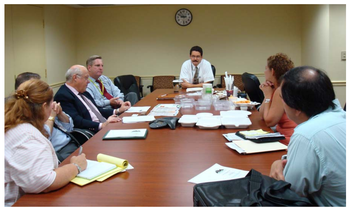
USDA cafeteria green team evaluating possible products.

Building on the lessons learned from the 2005 pilot test, since January 2007 USDA's Departmental Administration has been working with other USDA employees, representatives from other Federal agencies, a few private sector individuals knowledgeable in food service items, Sodexho--USDA's cafeteria operation contractor, and Sysco--primary supplier to Sodexho of food service products, to collect information on possible replacement items for petroleum-based food service items in USDA's Washington, DC area cafeterias. This task has proven more daunting than originally anticipated because USDA's policy is to examine all items carefully. As one wag commented, "you only have one chance to make a good first impression." The team knew from the Whitten pilot test that finding the right products was not going to be easy. Further, the team discovered it is difficult to ascertain final costs for such products since USDA will generally not be buying directly from the manufacturers and not all products are functioning as advertised or may not be readily composting according to ASTM 6400 standards.