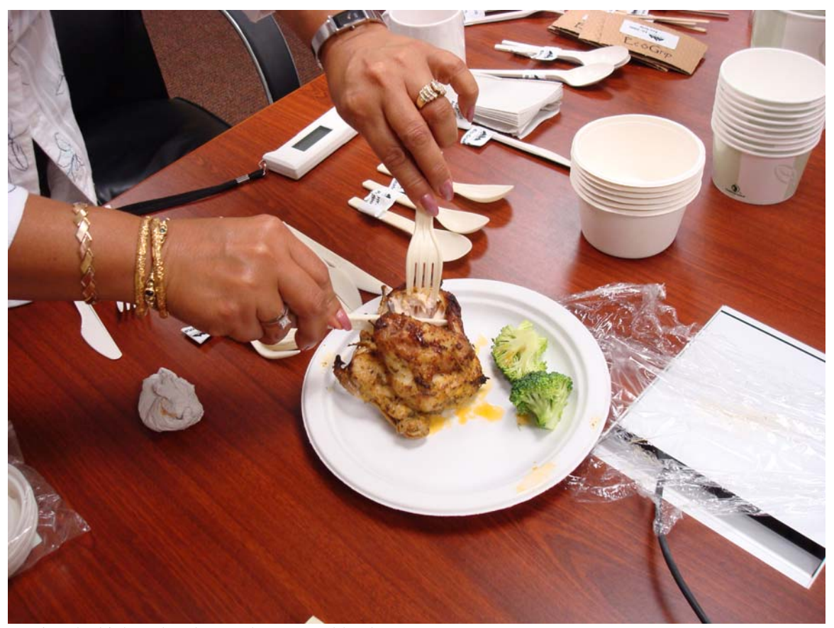
Testing the biobased cutlery and compostable plates.

Soon the team will make other recommendations for Phase I replacements such as eliminating the Styrofoam plates and bowls. Styrofoam plates were replaced with paper plates in June of 2007 and as soon as the stock of existing Styrofoam bowls is depleted all plates and bowls being used will be manufactured from high quality compostable paper. The team expects to recommend "Clam shells" (hinged containers) currently being made from petroleum plastic be replaced by PLA bioplastic made from corn. These PLA items will be for cold use only. For hot use a clam shell made from bagasse (sugar cane fiber) will be used. Clear petroleum plastic containers used for cold "grab and go" items, will be replaced with PLA bioplastic. The team will also suggest cold use Styrofoam cups and their petroleum based plastic lids be replaced by cups and lids made from PLA. Hot use Styrofoam cups and tops will be replaced by recycled paper cups and compostable lids made from vegetable starch according to planned team recommendations.