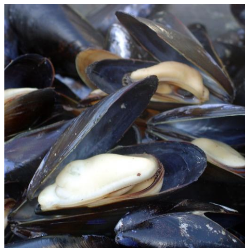
Bay/Blue Mussels (commercial)