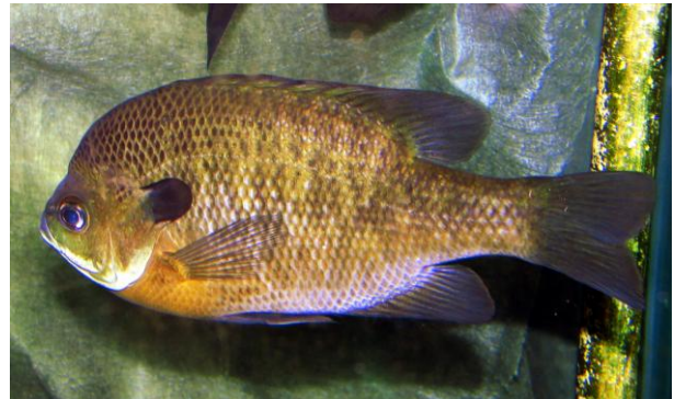
Scientists studied uptake and elimination of pharmaceuticals in bluegill sunfish ( Lepomis macrochirus ) pictured above to aid in understanding the exposure risks, if any, to aquatic organisms or to humans through fish consumption.

Temazepam and methocarbamol were consistently detected in bluegill samples, so their uptake and elimination was studied in more detail. Over 30-day exposures, temazepam and methocarbamol demonstrated relatively rapid uptake and rapid elimination, indicating that internal tissue concentrations were driven by external environmental concentrations. This information indicates that overall persistence of the selected pharmaceuticals within bluegill tissues in the environment is likely to be low unless they reside downstream from a consistent, substantial, external contaminant source.